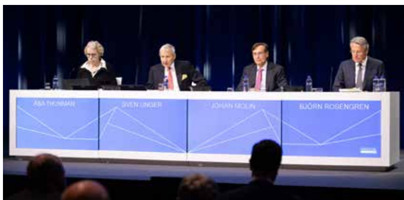
Sandvik's Annual General Meeting 2019 was held at the Göransson Arena, Sandviken, Sweden.

In accordance with this instruction, the Nomination Committee shall consist of representatives of the four largest shareholders, in terms of the number of votes, on the final business day in August plus the Chairman of the Board (convener).