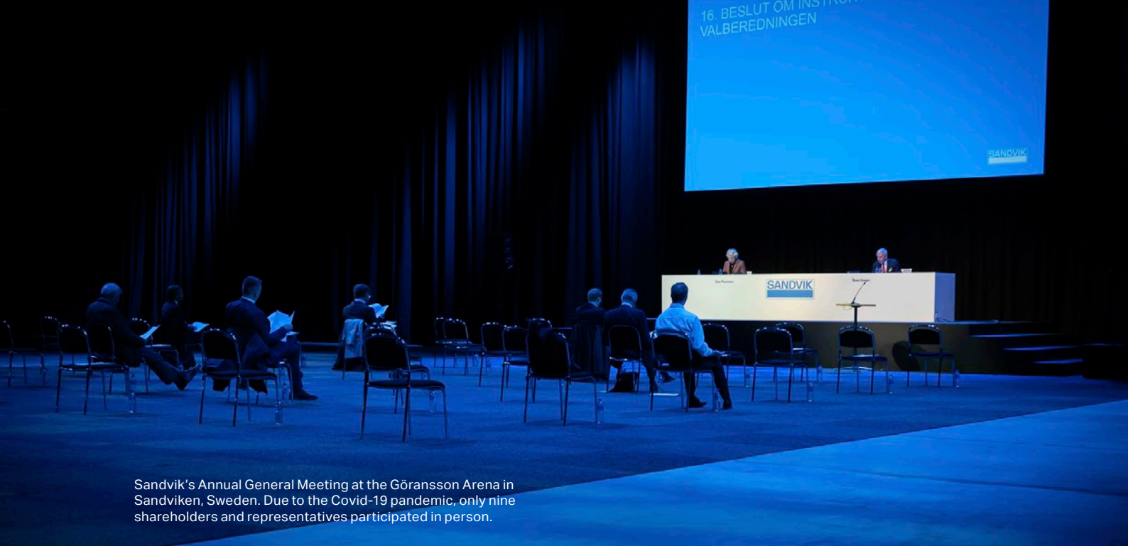
Sandvik's Annual General Meeting at the Göransson Arena in Sandviken, Sweden. Due to the Covid-19 pandemic, only nine shareholders and representatives participated in person.

For additional information about the Annual General Meeting, including the minutes, refer to: home.sandvik .